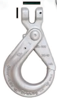
S-1317 Clevis Hook