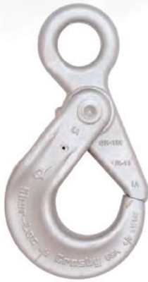
S-1316 Eye Hook