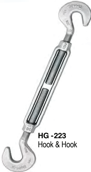
HG -223 Hook & Hook

Meets the performance requirements of Federal Specifications FF-T-791b, Type 1 Form 1 - CLASS 5, and ASTM F-1145, except for those provisions required of the contractor. For additional information, see page 476.