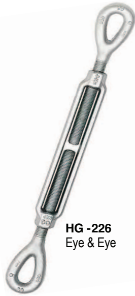
HG -226 Eye & Eye

Meets the performance requirements of Federal Specifications FF-T-791b, Type 1 Form 1 - CLASS 4, and ASTM F-1145, except for those provisions required of the contractor. For additional information, see page 476.