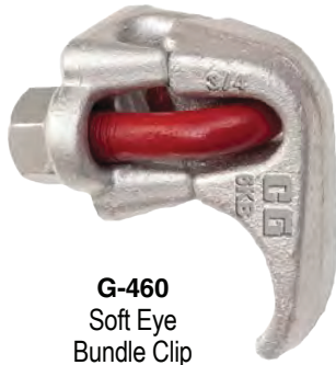
G-460 Soft Eye Bundle Clip (For use without Thimble)