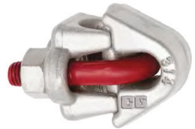
G-461 Thimble Eye Bundle Clip