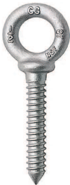
G-275 Screw Eye Bolts

*Ultimate Load is 5 times the Working Load Limit. Maximum Proof Load is 2 times the Working Load Limit.