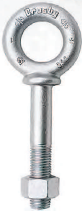
G-277 Shoulder Nut Eye Bolts