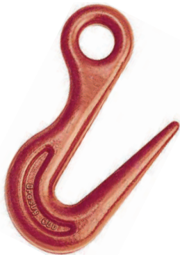
A-378 Sorting Hook

*Ultimate Load is 5 times the Working Load Limit.