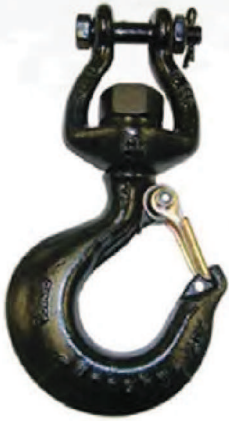
S-3316 Replacement Hook