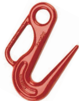
A-378 Sorting Hook