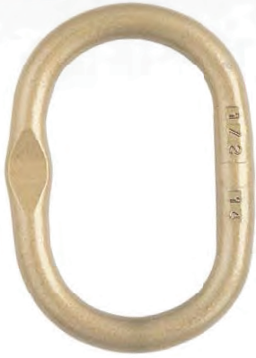
A-344 Welded Master Links

Ultimate Load is 5 times the Working Load Limit. Applications with wire rope and synthetic sling generally require a design factor of 5. Based on single leg sling (in-line load), or resultant load on multiple legs with an included angle less than or equal to 120 degrees. ** Proof Test Load equals or exceeds the requirement of ASTM A952(8.1) and ASME B30.9. For use with chain slings, refer to page 245 for sling ratings and page 240 for proper master link selection.