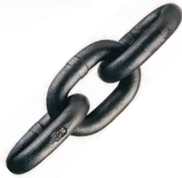
Spectrum 10® Grade 100 Alloy Chain