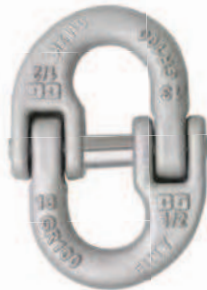
A-1337 10 Alloy Connecting Link

* Proof tested at 2 times Working Load Limit. Ultimate Load is 4 times the Working Load Limit.